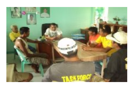
ACTION TAKEN signed amicable settlement