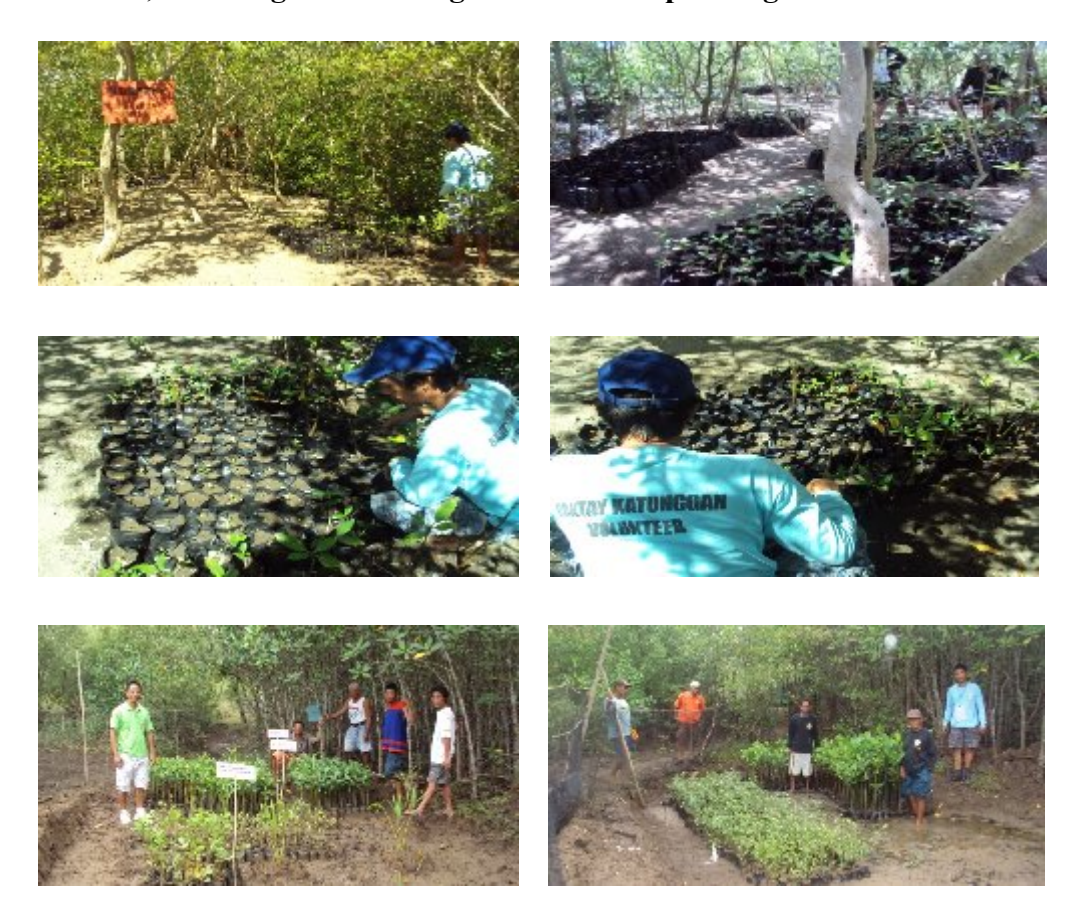
IV. Conducted mangrove assessments at Brgy. Punao, So. Maloloy-on & Pasil

- 8,100 mangrove seedlings available for planting: